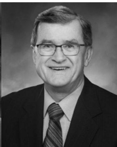
Sen. Curtis King